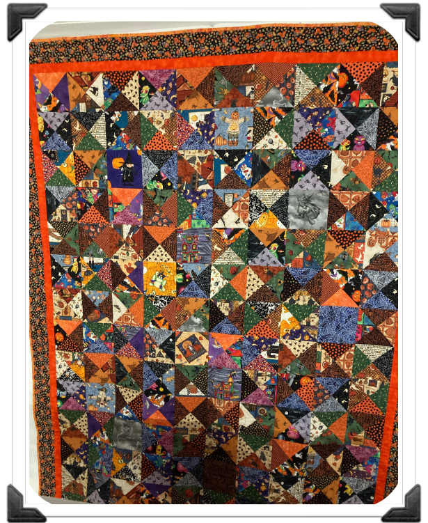
60-½ x 80-½ FINISHED SIZE

*Decide on the border prints and binding after the center is completed. There should be a good contrast between the scrappy blocks and the inner border, to provide a rest from the busy center.